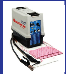
Workhorse 300SH Combined Preheater & Welder