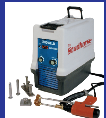
Studhorse 1000DM & 1200DM Stud Welders