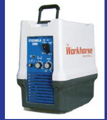
Workhorse 300S Stick/Lift Start TIG