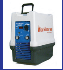
Workhorse 300ST ArcStarter TIG