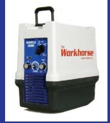
Workhorse 300MS MIGweld