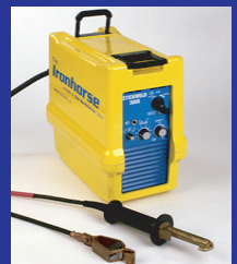
Ironhorse 300S 700V DC Input